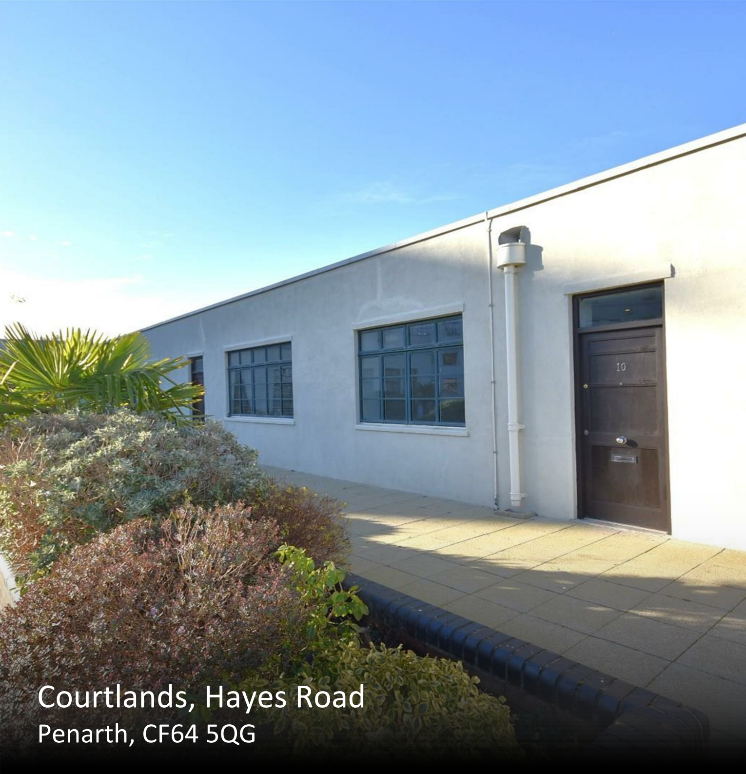
Courtlands, Hayes Road Penarth, CF64 5QG